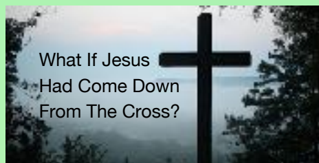
What If Jesus Had Come Down From The Cross?