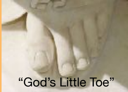
“God’s Little Toe”

SCRIPTURE READING 1 Corinthians 12:12-20 Logan Wolfe